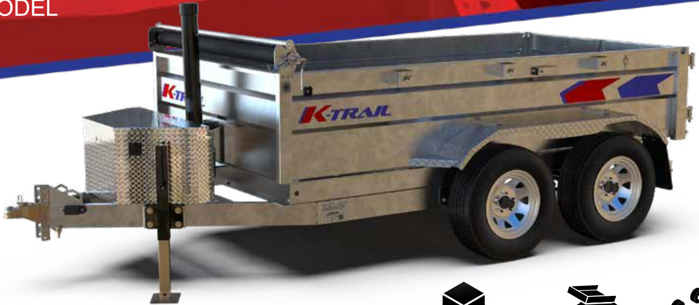
D510-10-SS Shown Subject to change