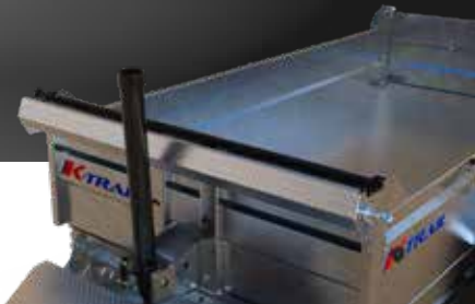
STANDARD TARP PROTECTOR