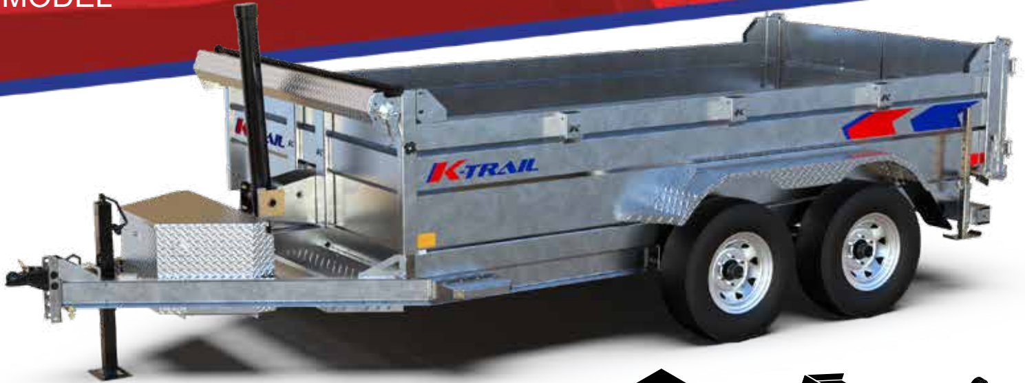
D612-10-RS shown Subject to change