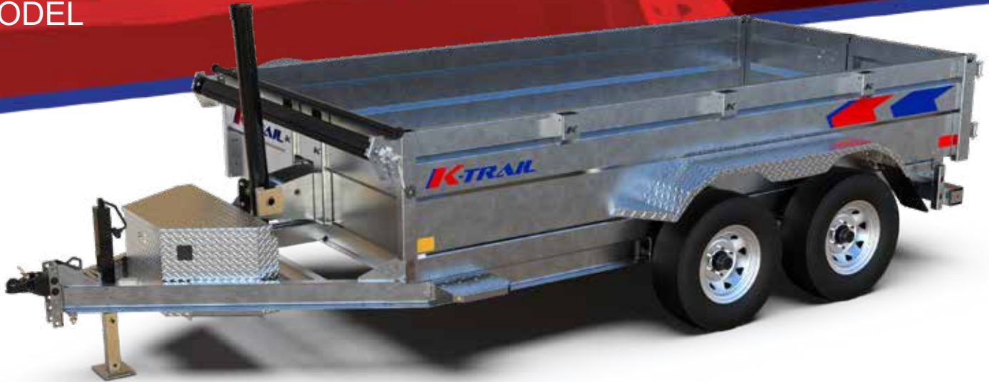
D612-10-SS Shown Subject to change