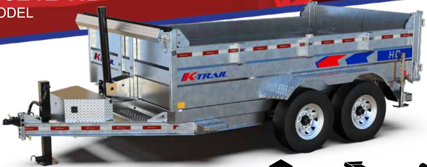
D8212-14-HD shown Subject to change