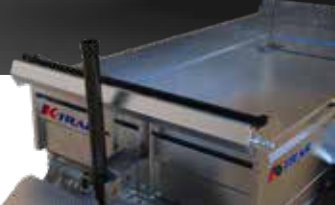
STANDARD TARP PROTECTOR