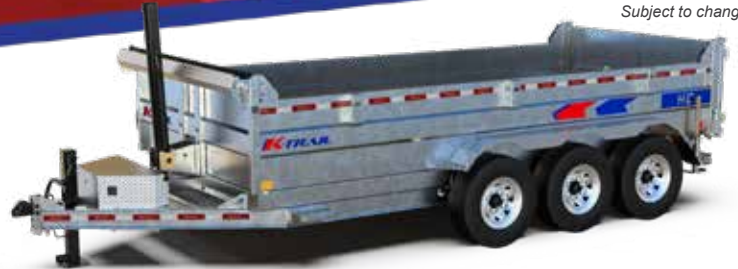
D8216-21-HD Subject to change