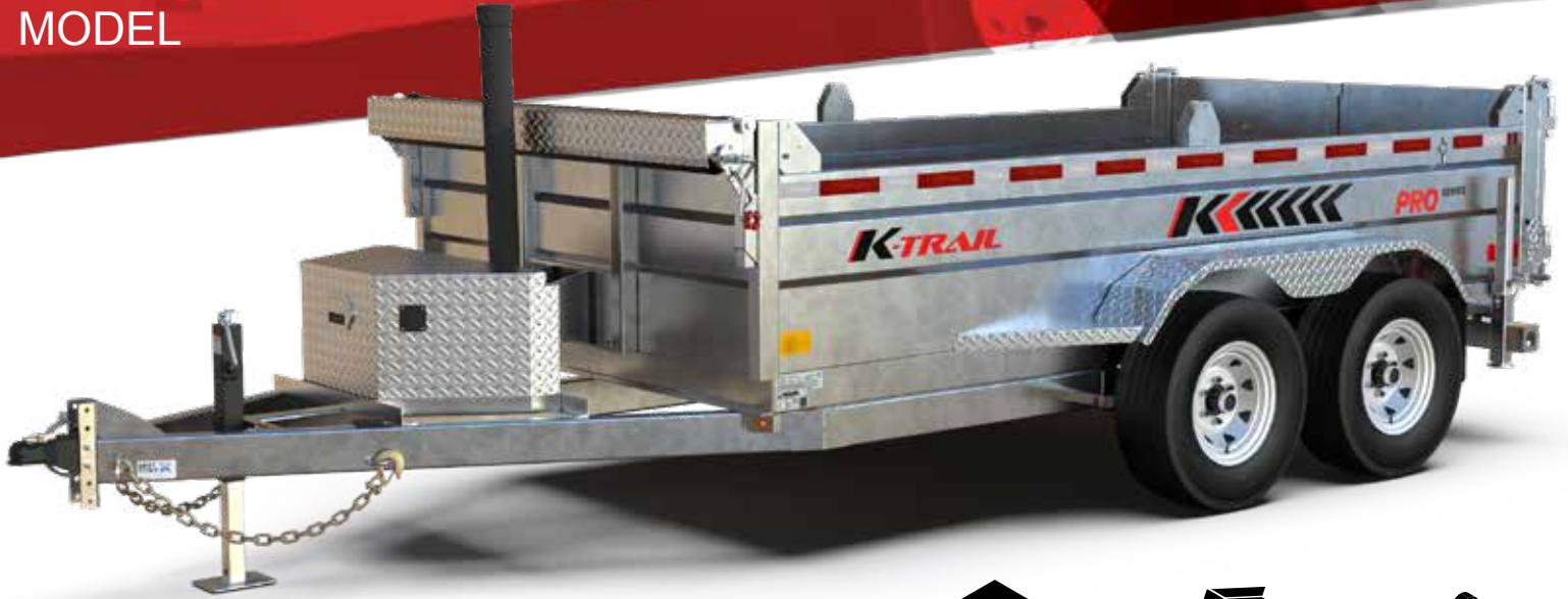
D612-10-PS shown subject to change