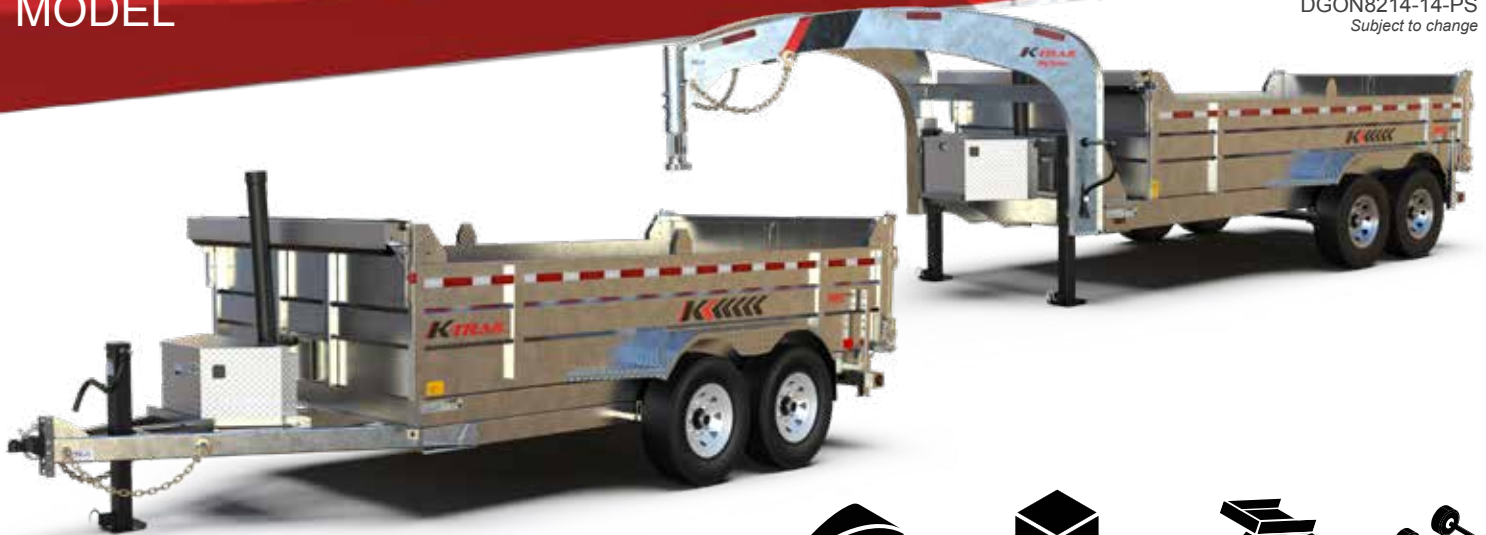
D8214-14-PS subject to change