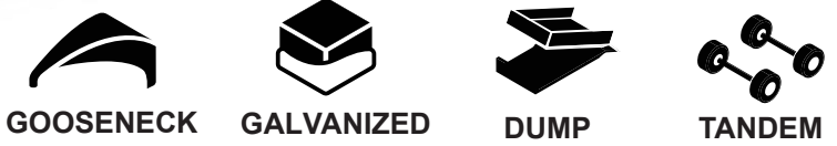
DGON8214-14-PS Subject to change

Now we're talking! Our 14,000-lbs. capacity, 82-inch wide by 14-foot long dump trailers are designed for professionals.