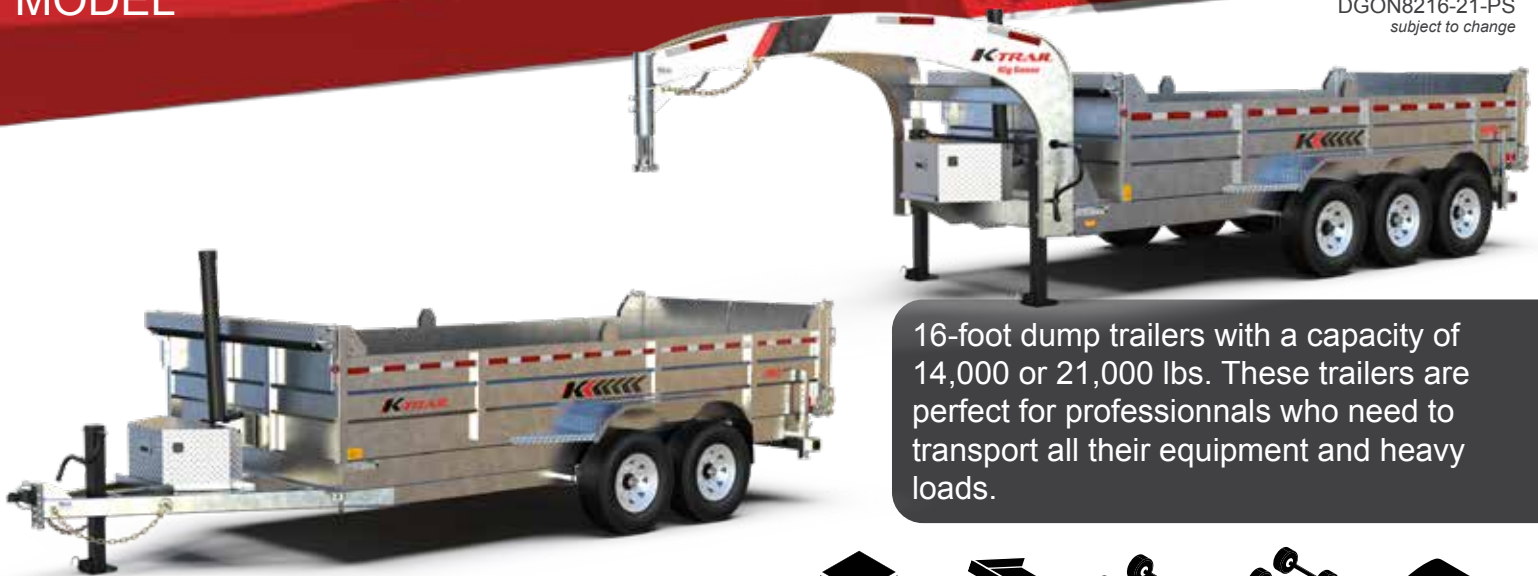
DGON8216-21-PS subject to change