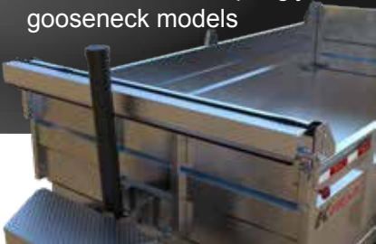
STANDARD TARP PROTECTOR