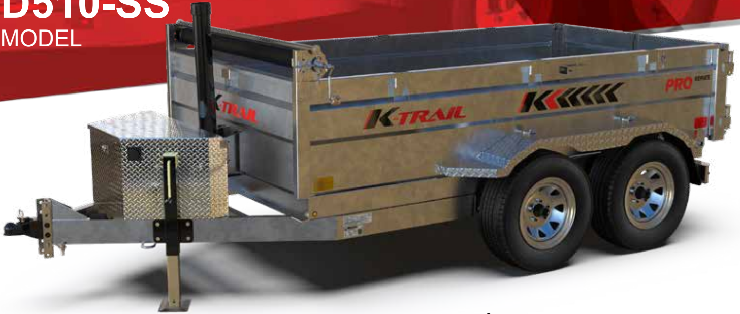
D510-10-SS2 Shown subject to change