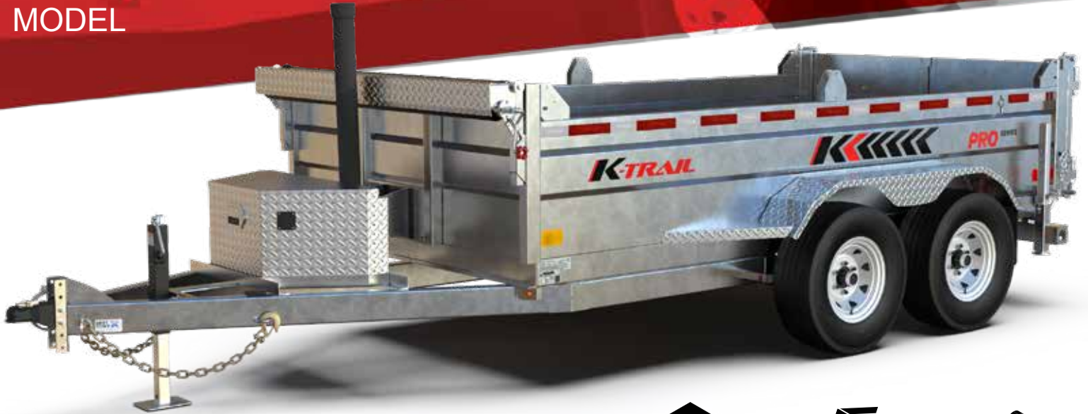
D612-10-PS shown subject to change