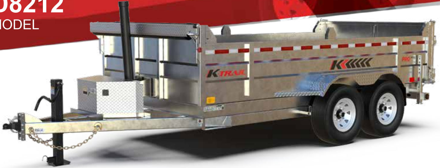
D8212-14-PS-20 shown subject to change