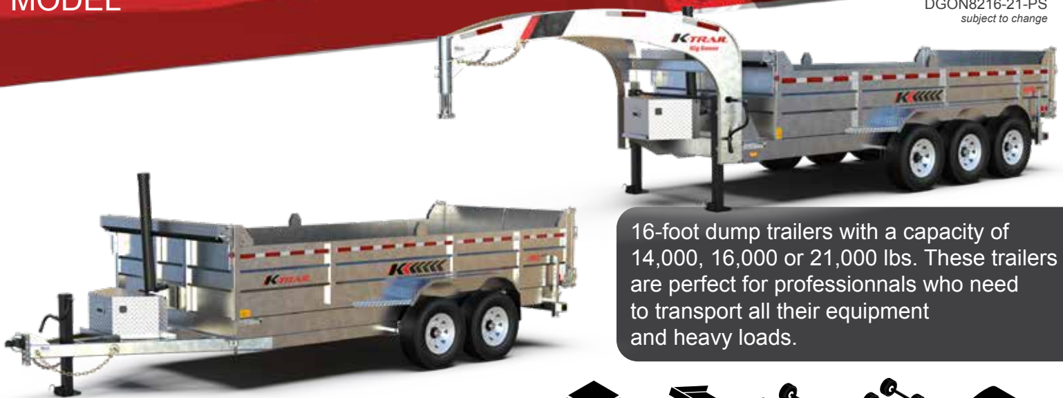
DGON8216-21-PS subject to change