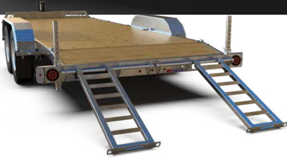
SLIDE-IN RAMPS (CH20-10-RT)