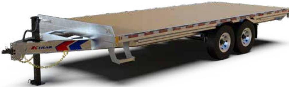
DKO20-14 shown subject to change