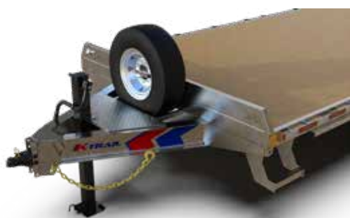
INTEGRATED SPARE TIRE MOUNT