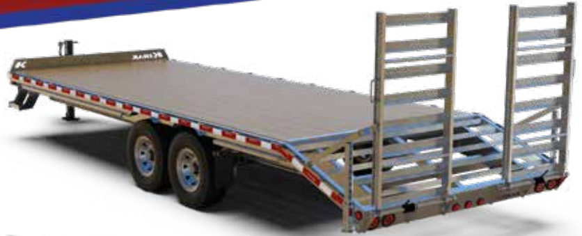
DKO20-3-14 shown subject to change