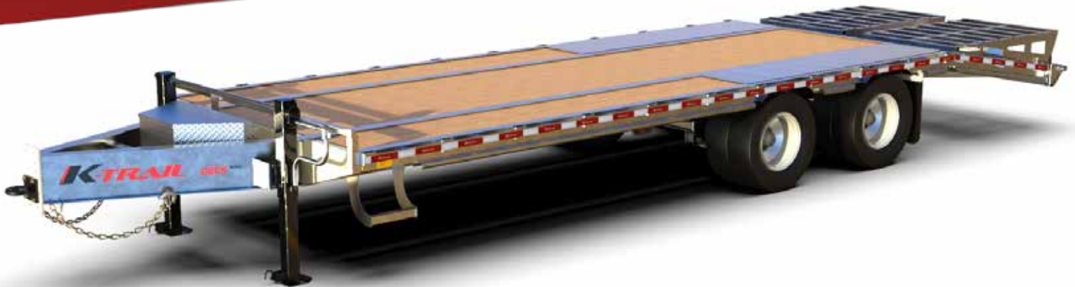
TAGD25-5LHT30HR40-01-22 shown subject to change