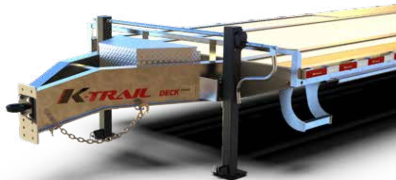
DROPED TONGUE (ON REQUEST)