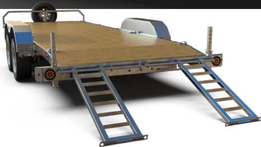
SLIDE-IN RAMPS (10,000 LBS. MODELS)