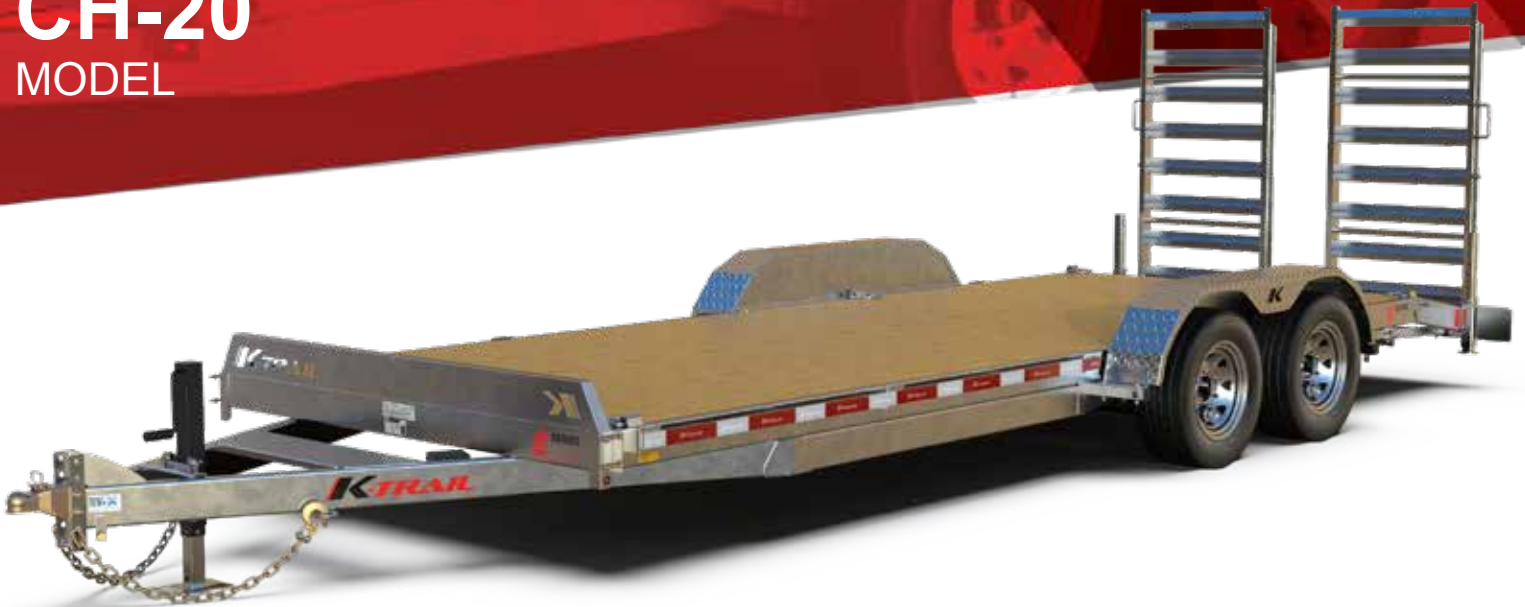
CH20-14 shown subject to change

The ideal trailer for transporting your equipment. Our models are available in 18- and 20-foot lengths and two load capacities. Simply pick the one that works best for you.