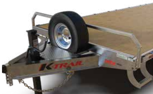
INTEGRATED SPARE TIRE MOUNT