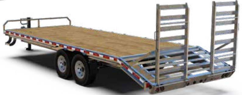
DKO20-3-14 shown subject to change