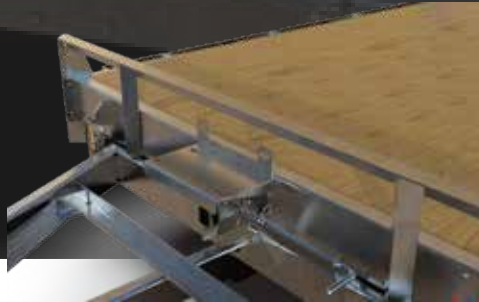
WINCH PLATE (HYDRAULIC MODEL)