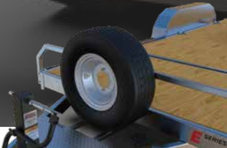
FRONT SPARE TIRE (GRAVITY MODEL)