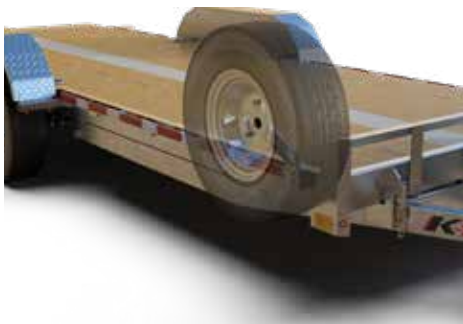
SPARE TIRE (HYDRAULIQUE MODEL)