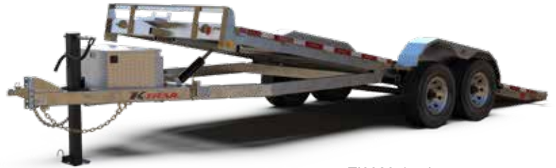
TI8020-14 shown subject to change