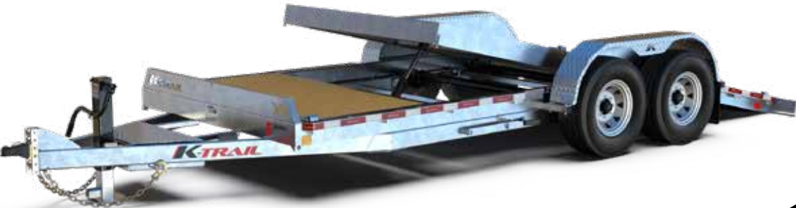
TI8216-4-14 shown subject to change