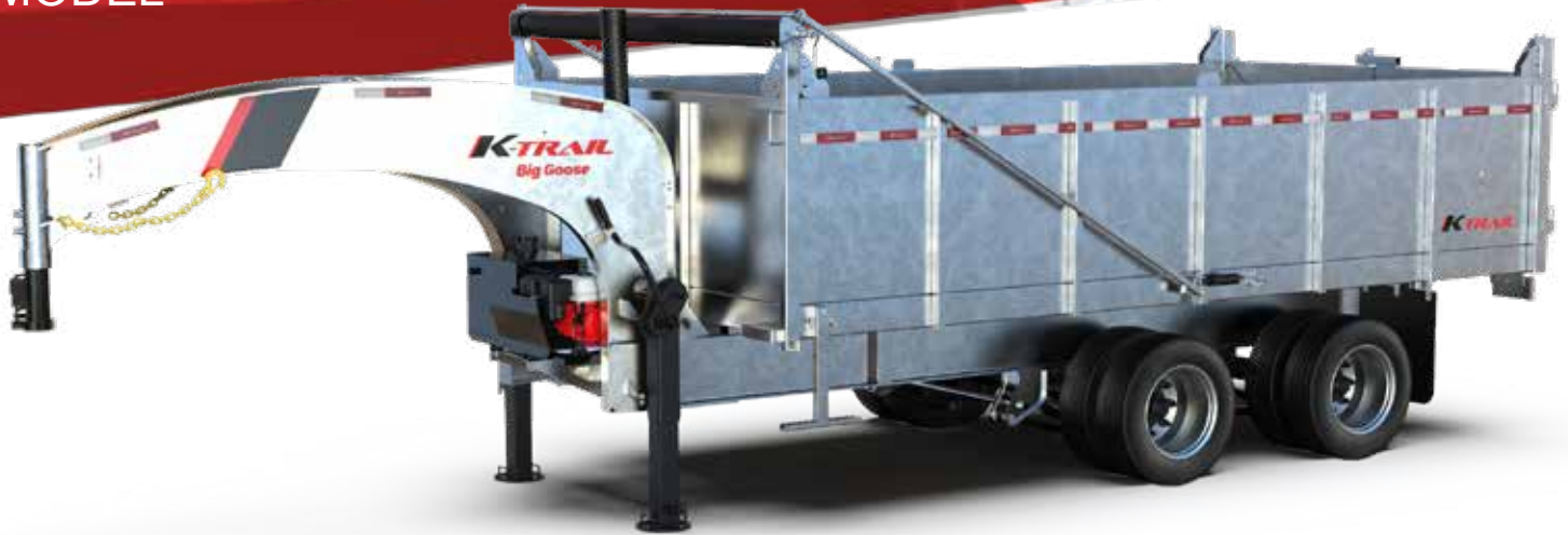
DGON9616HT30H-G2 Shown subject to change