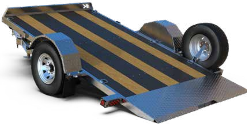
NON-SLIP WOODEN TILTING DECK (BLACK WOOD)