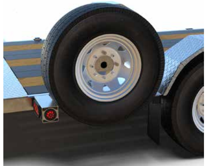
SERIES SPARE TIRE