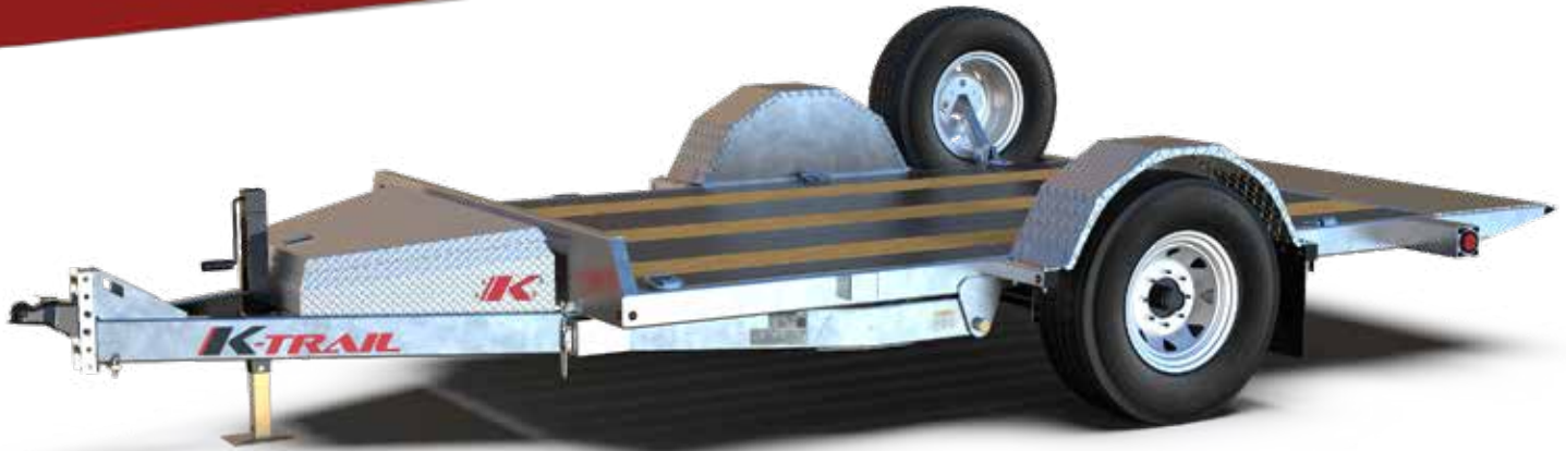
TI7812-S7 Shown subject to change